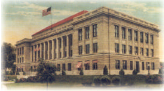
The Baton Rouge Court Building built in 1925